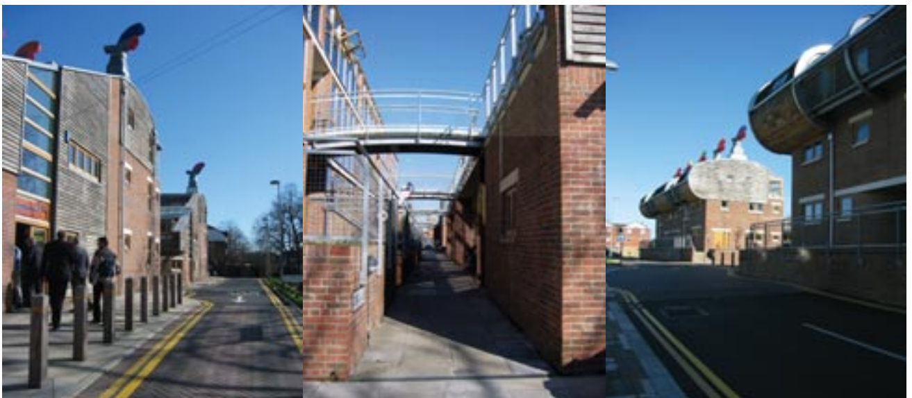
Commission visit to Beddington Zero Energy Development (BedZED)

The Government's national consultation on the future of air travel in the UK ran for most of the year. Air travel is a challenging issue in terms of sustainability and the Commission is undertaking work towards understanding its impact. A response to the South East consultation will be submitted by the end of June 2003 and will be posted on our web pages.